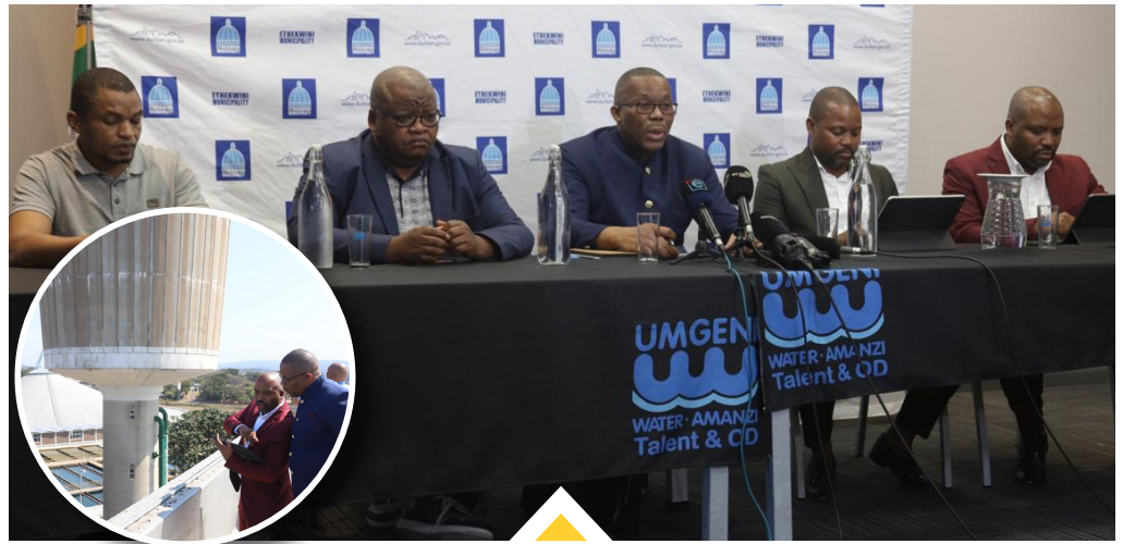
eThekweni Municipality leadership together with uMngeni-uThukela Water management held a media briefing on 1 September to provide an update on the interventions to deal with the upsurge of algae which has resulted in the reduction of treated water to the City's northern areas.

The presence of algae has resulted in the reduction of water volumes from UUW's Durban Heights Water Treatment Works from 590 megalitres per day to an average of 380 megalitres per day. In an effort to suppress the spread of algae, the UUW continues to treat raw water at the point of abstraction at the Nagle Dam. This is being done in order to decrease the concentration of algae before it reaches the Durban Heights Water Treatment Works. The Water Board is also using shaft pumps to draw water from the Inanda Dam which