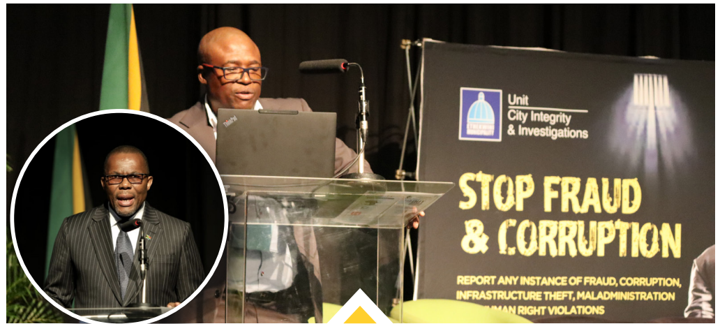
EThekweni Mayor Councillor Cyril Xaba (inset) and Head of the City Integrity and Investigations Unit Jimmy Ngcobo were among the delegates that attended the fraud and corruption seminar at the Inkosi Albert Luthuli International Convention Centre.

EThekweni Mayor Councillor Cyril Xaba said the Municipality is committed to building a capable, honest, and transparent administration. "We will achieve this by regularly conducting lifestyle audits on public servants who occupy strategic positions in the City