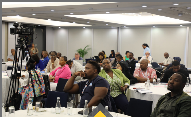
The Municipal Institute of Learning and the Safer Cities Unit united to discuss the issue of homelessness and propose possible sustainable solutions.