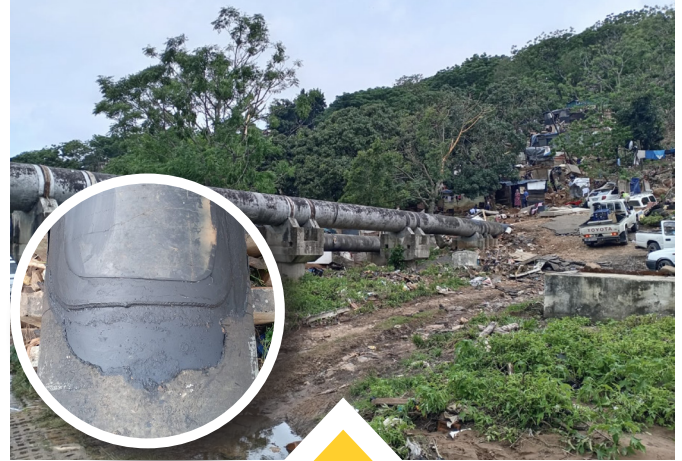
Teams were on site to repair the central aqueduct which burst and flooded informal settlements in the vicinity of the M19 in Reservoir Hills.

It is important to get building plans approved by the Municipality.