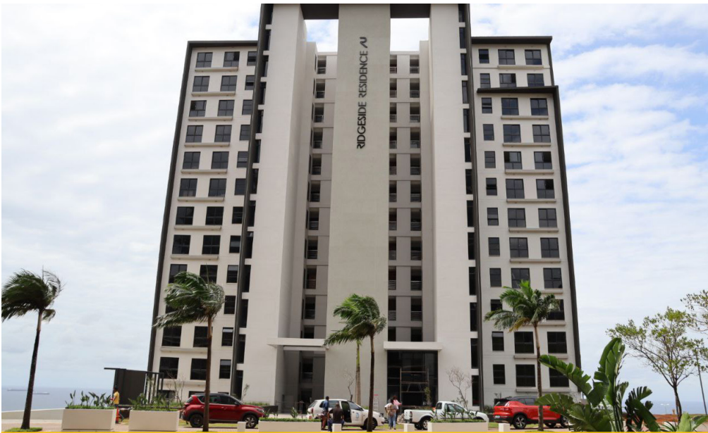
Ridgeside residents are among those who have benefited from the City's Economic Development Incentive Policy.

THE 5th reviewed Economic Development Incentive Policy (EDIP) 2024/2025 aims to incentivise foreign and local property investments, sustain enterprises, and cultivate a competitive investor-friendly environment in eThekweni. The policy offers financial